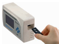
Detachable sensor cartridge