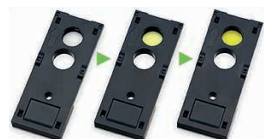
Colorimetric reaction to exposure